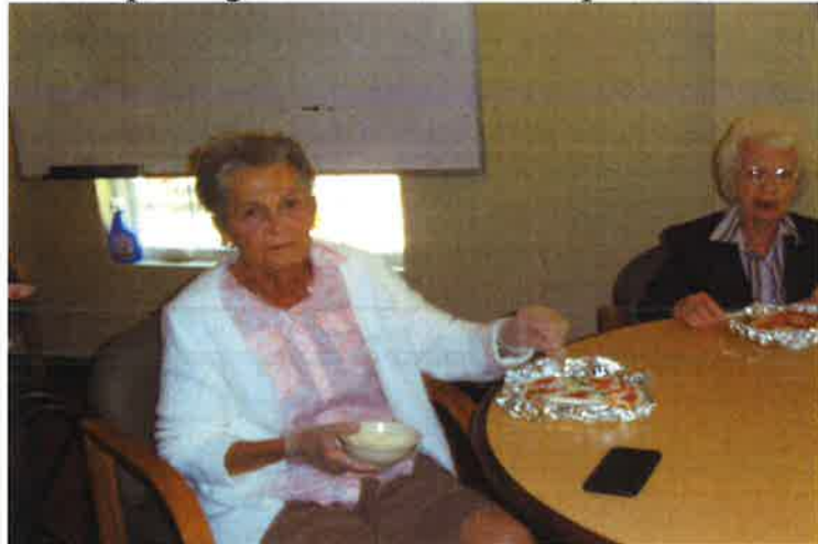
Marge: using some fresh basil and fresh herbs they make everything taste better.