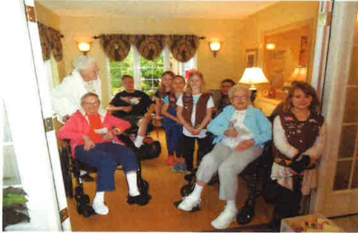
Showing off the badges they have earned.