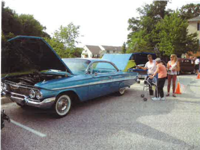
We could not pick a favorite, they are all Beautiful!