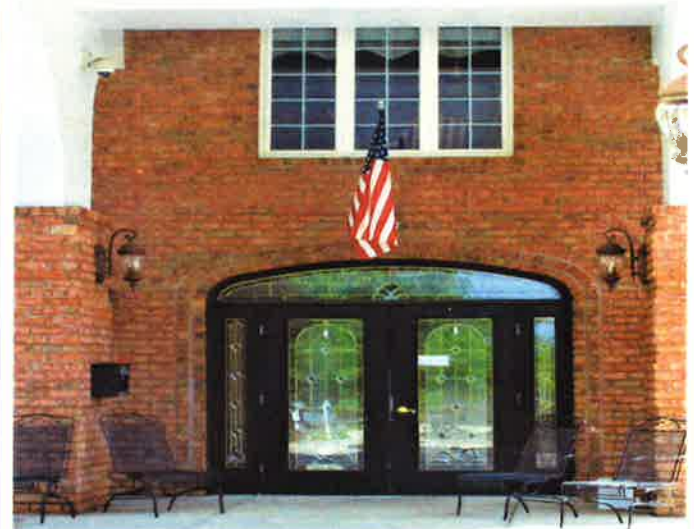
On behalf of everyone here at Hart Heritage, I would like wish our residents and family members a Happy and Safe Fourth of July.