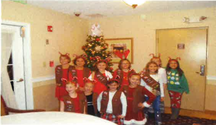
Advent church choir

We had lots of carolers come visit us this year. I would like to thank Girl Scout Troops #100,#333,#2012,#4808, and#921; also Advent Church, Country Life 4-H, and The Just Having fun singers. You are all wonderful and we appreciate you donating your time and talent, to come see us. Thank you Troop #100