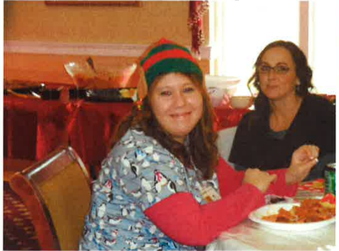
Did someone say "free food"?