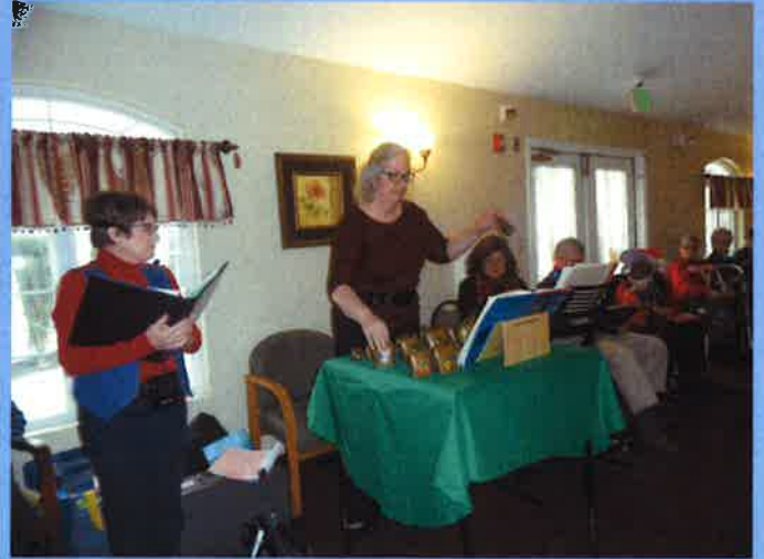
Troop # 333,2012

We all loved hearing the Hand bells, playing Christmas songs.